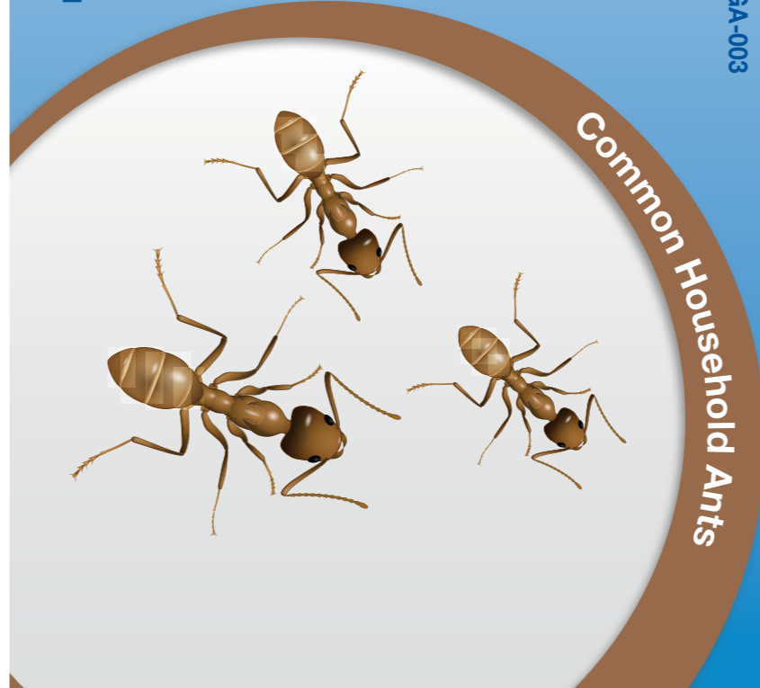
Common Household Ants

Produced for: Bayer Environmental Science A Division of Bayer CropScience LP 2 T. W. Alexander Drive Research Triangle Park, NC 27709 Product of China