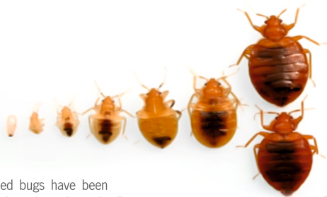
Bed bugs have been enlarged to show detail and are not to scale.